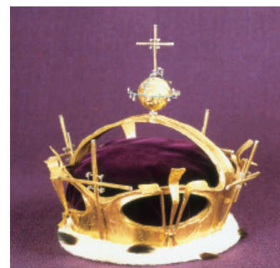
The crown, 1969.