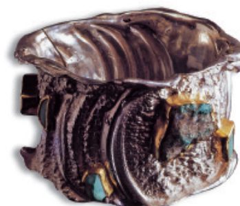
Elizabeth Taylor's bracelet, 1968.